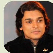
Rahul Easwar Social Activist