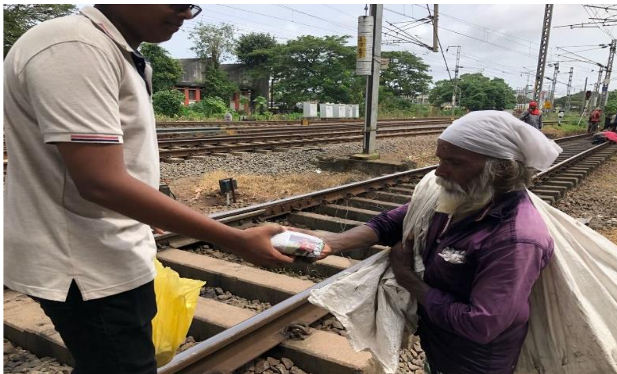
Food Collection and Distribution by NSS

NSS Volunteers launched an initiative to provide food to homeless people. Students collected food items in their groups and distributed it to the poorly underprivileged people in and around the milieu. This was a part of the strategy to make studies and service to go hand in hand. They are successfully continuing their program feeding the poor people around them.