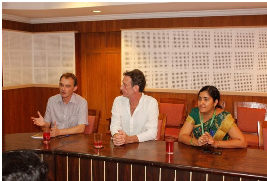
Interactive Session with Delegates from French Embassy

Department of French organized an interactive session with delegates from French Embassy. The prospects of higher studies in France were discussed in the session.