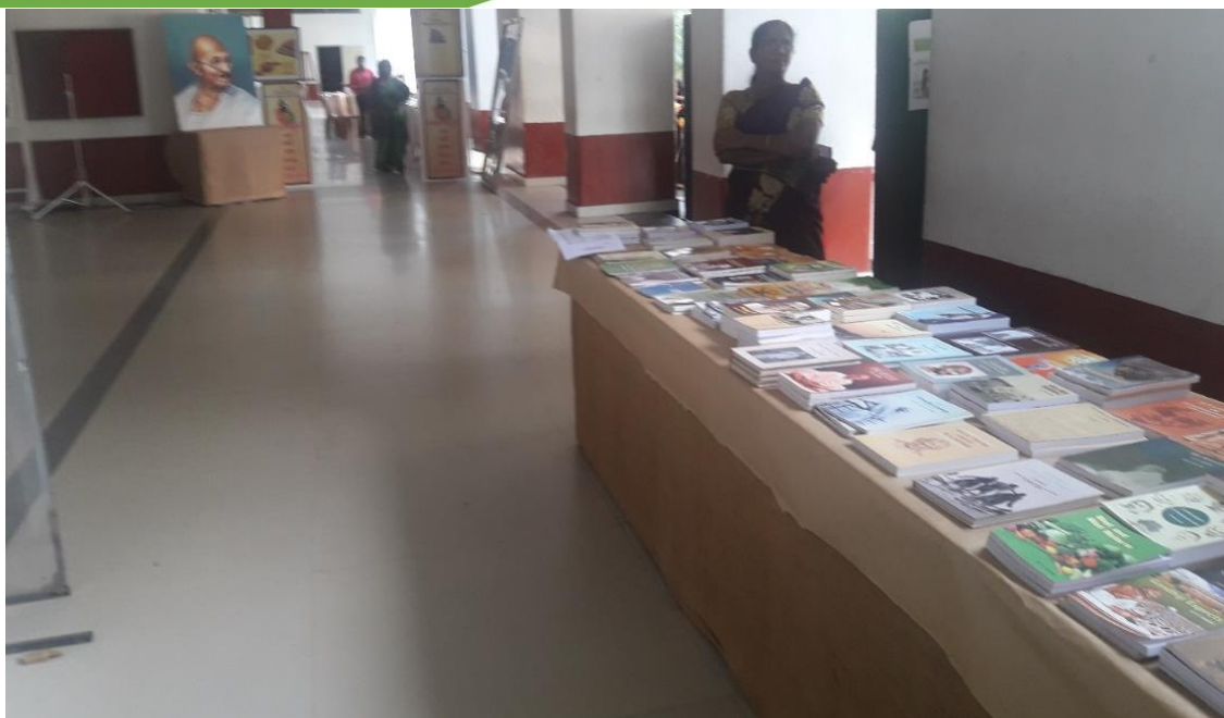
Exhibition and sale of books on the life and times of Gandhiji

Name of the Programme: EXHIBITION ON KHADI PRODCUTS