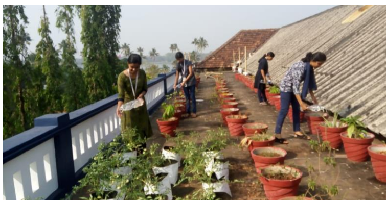
Planting of 75 trees - Dasapushpam

Bhoomithrasena Club of SH College started a tree planting initiative for planting 75 trees to commemorate the Platinum Jubilee of the college. Saplings were planted in growbags for this purpose.