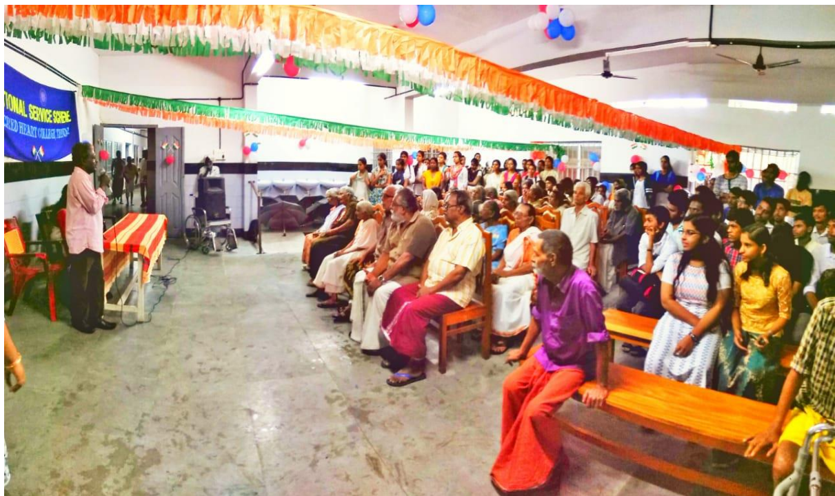
Independence Day Celebrations with the elderly

Independence Day was celebrated by NSS unit with Elderly people on 18 th August 2018. As part of this, various cultural events were organized by NSS volunteers.