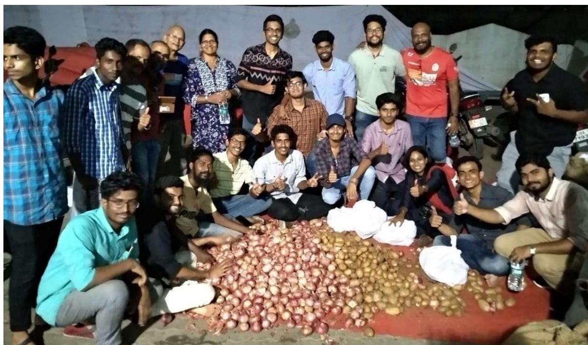
Packing and Sorting of Flood Relief Materials

SH campus was a collection point for packing and sorting of flood Relief materials. NSS volunteers actively participated in collection, sorting and packing of the relief materials.