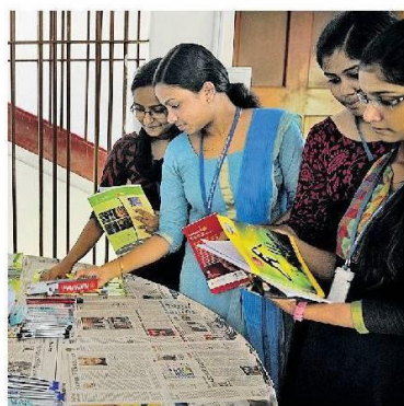
തേവര എസ്എച്ച് കോളജിലെ ഹോണസ്റ്റ് ഷോപ്പ്.