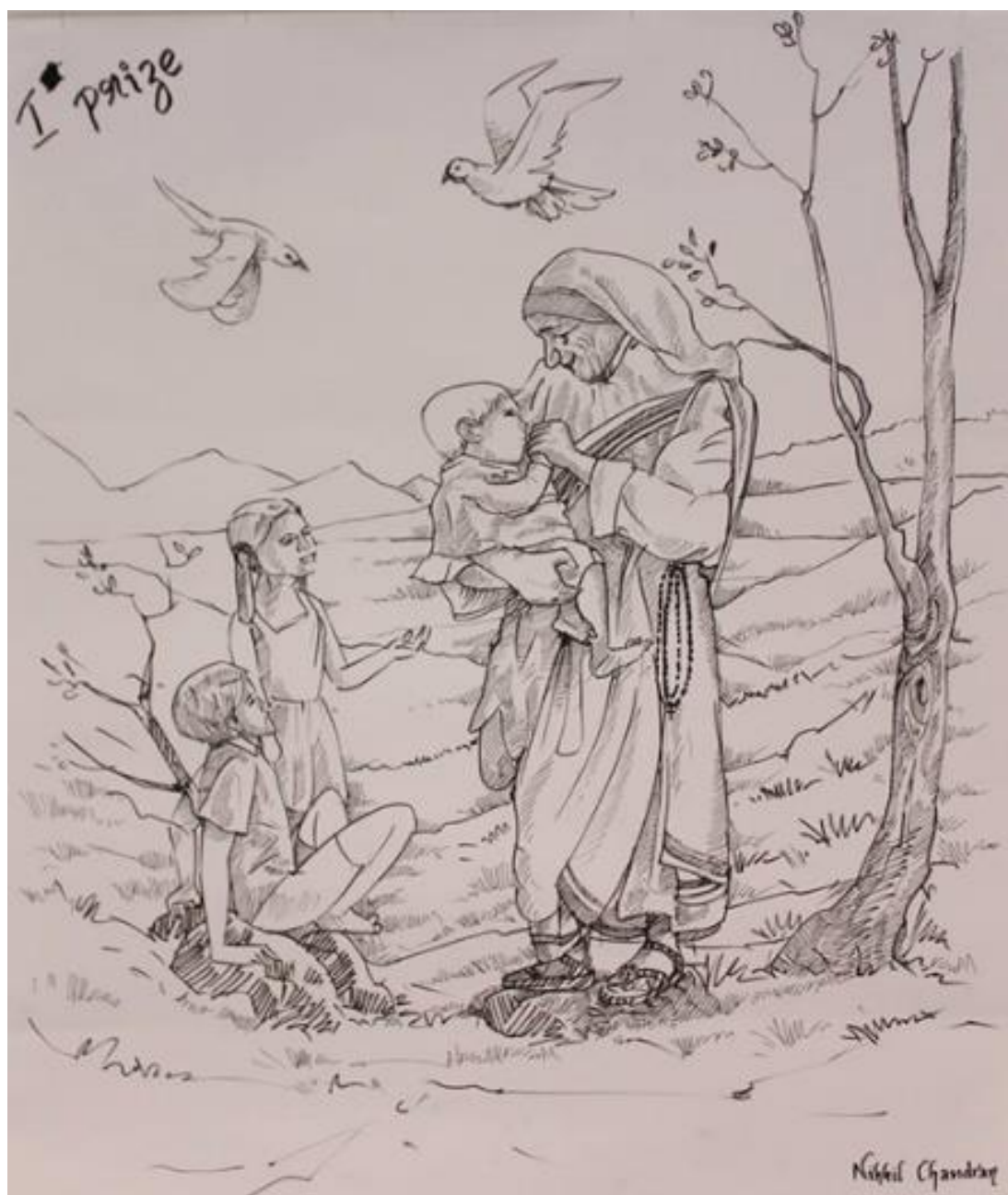
Mother Theresa- Poster design Competition

A poster designing competition and exhibition on Mother Theresa was held on 5 th September 2016 in connection with declaration of sainthood to Mother Theresa. The event was conducted by Jesus Youth.