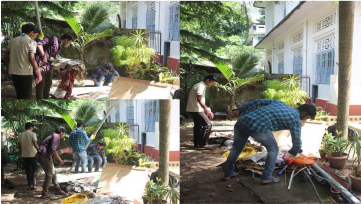
Students engaged in waste segregation