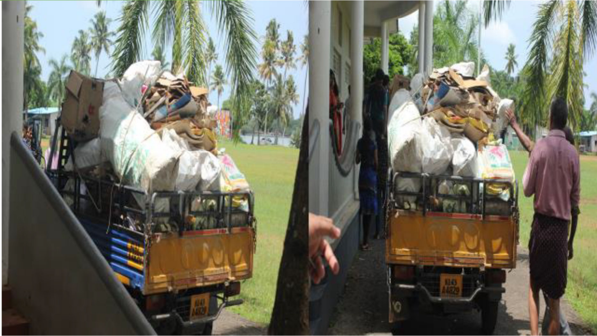
Segregated waste materials loaded for further recycle