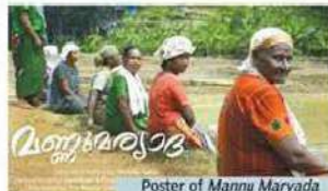
Poster of Mannu Maryada