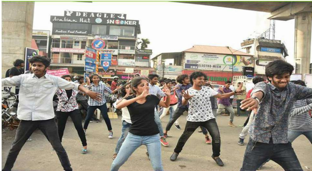
Fourth performance of Child Protection Awareness programme at Edappally jointly with the Ernakulam District Child Welfare Unit of Social Justice Department 2017 Nov 20

Park and Edappally in association with the Ernakulam District Child Welfare Unit of Social