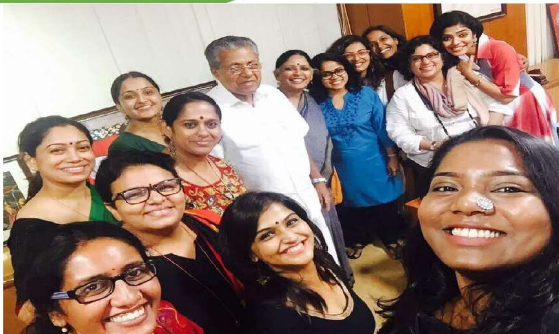
The selfie of WCC founders on May 18 with the Chief Minister of Kerala.