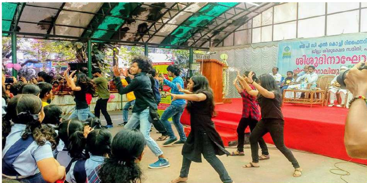
performance of Child Protection Awareness programme at Subhash Park jointly with The Ernakulam District Child Welfare Unit of Social Justice Department 2017 Nov 18

Justice Dept on Nov 18. The dynamic performance by students attracted the attention of