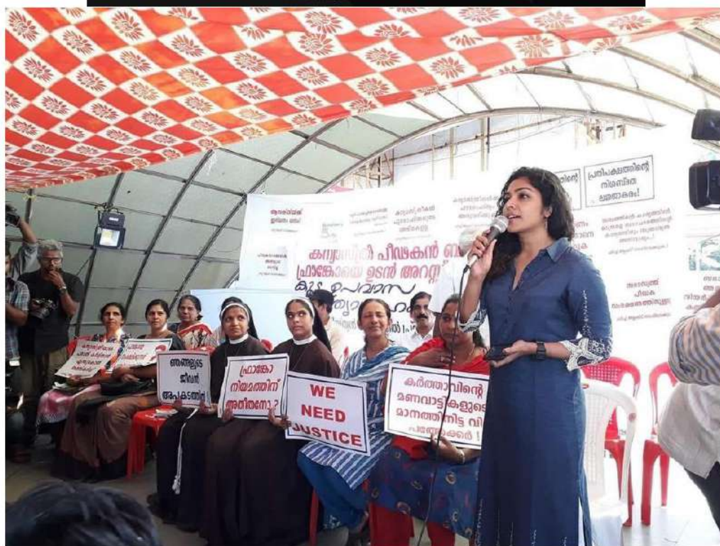
Women supporting each other in various situations of workplace harassment.