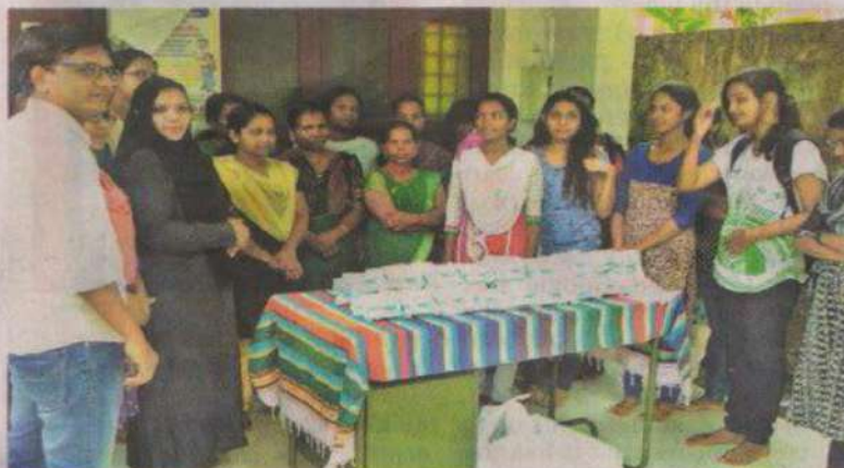
REACHING OUT Student-volunteers with women at Illithode panchayat

The college tied up with a Kudumbashree unit manufacturing sanitary napkins in Ernakulam