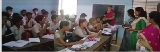
ബാല പീഡന വിരുദ്ധ സന്ദേശങ്ങൾ വിതരണം ചെയ്ത വിദ്യാർത്ഥികൾ

കുട്ടികൾ പീഡനത്തിന് ഇരയാകാതിരിക്കാൻ സാമ്പത്തിക അതിഥി, കലാ അതിഥി പാൽ വഴിയായി നൽകിയ സന്ദേശങ്ങൾക്ക് ഇതിൽ പ്രതികരണം കാഴ്ചവെച്ചു. പീഡനത്തിന്റെ ഭയാനകതയെക്കുറിച്ച് വിദ്യാർത്ഥികൾക്ക് അറിയാൻ സാധിക്കാൻ സാധിക്കുന്ന വിധത്തിൽ സന്ദേശങ്ങൾ വിതരണം ചെയ്തു. പീഡനത്തിന്റെ ഭയാനകതയെക്കുറിച്ച് വിദ്യാർത്ഥികൾക്ക് അറിയാൻ സാധിക്കാൻ സാധിക്കുന്ന വിധത്തിൽ സന്ദേശങ്ങൾ വിതരണം ചെയ്തു.