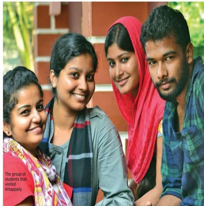
The group of students that visited Attappady