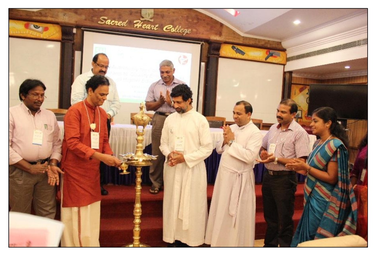
Inaugural Ceremony of the Workshop (08/01/2015)