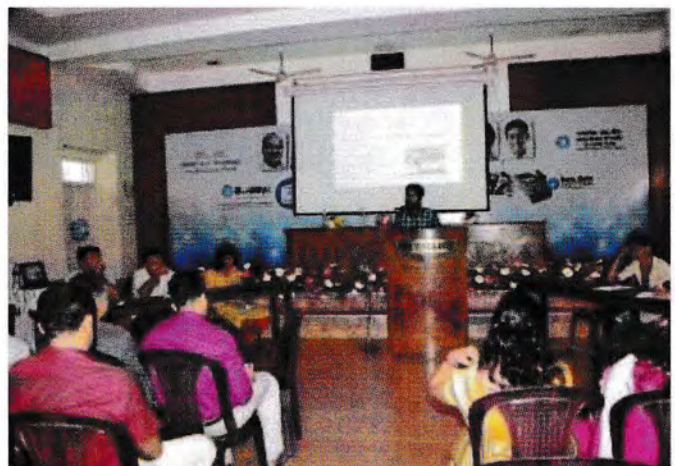
Economics Association Inauguration