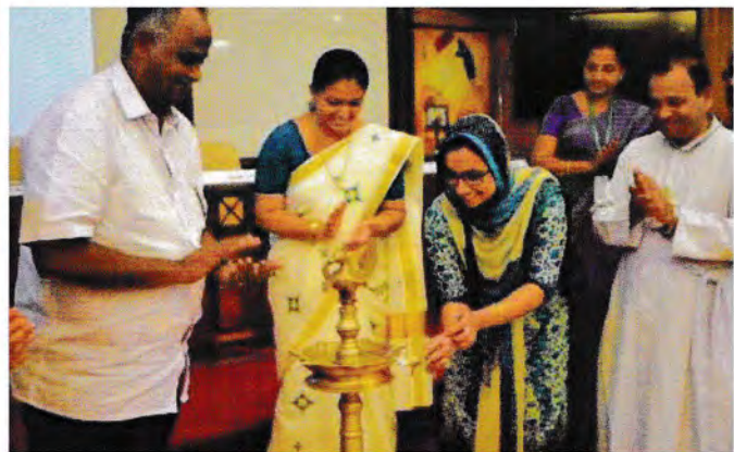
Computer Science Association Inauguration