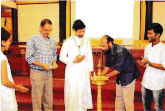
Zooology Association Inauguration