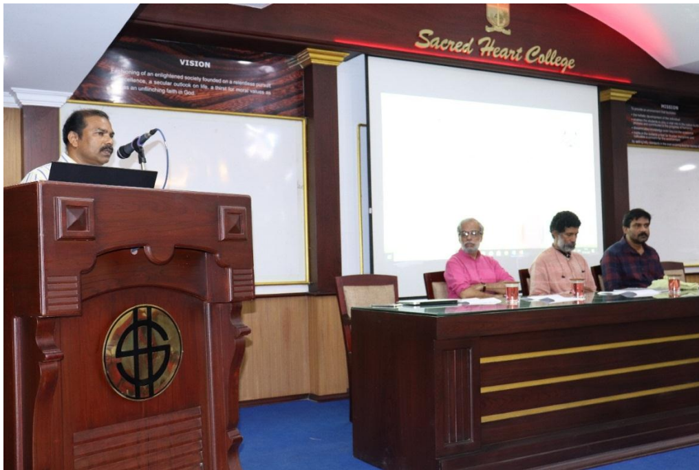
Inaugural Session of the OBE Workshop (03/04/2019)