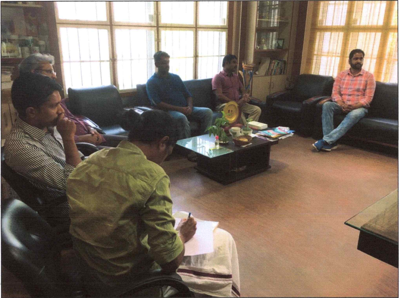
Ice-breaking Session of Faculty Induction Programme – 2014 (14/10/2014)