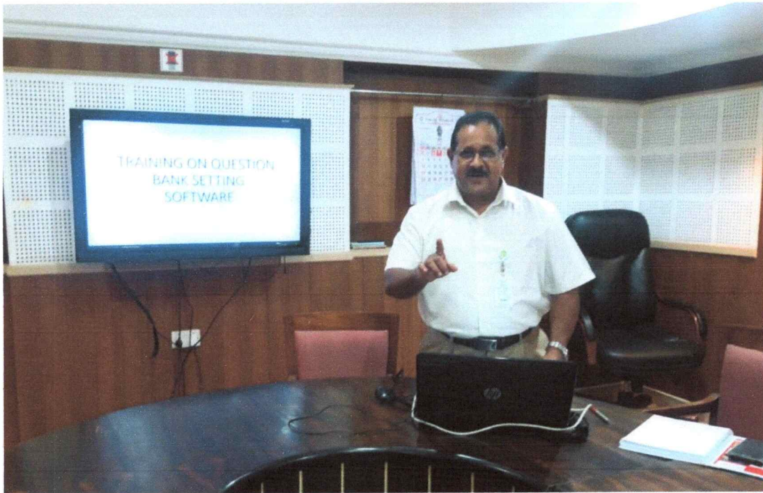
Deputy Controller of Examinations Demonstrating the Question Bank Setting Software on 27 March 2017