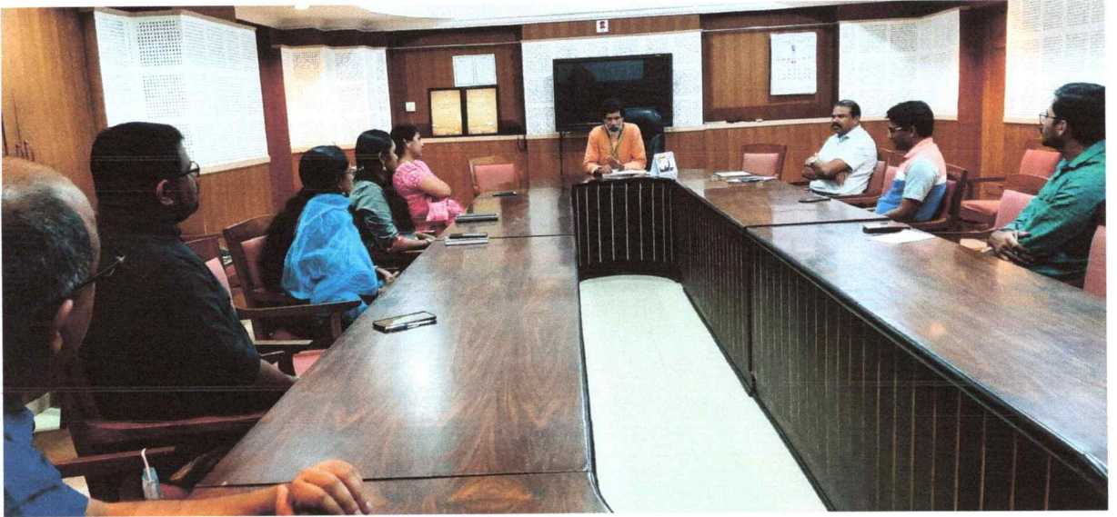
Principal Orientation during FIP-2015 (24/07/2015)