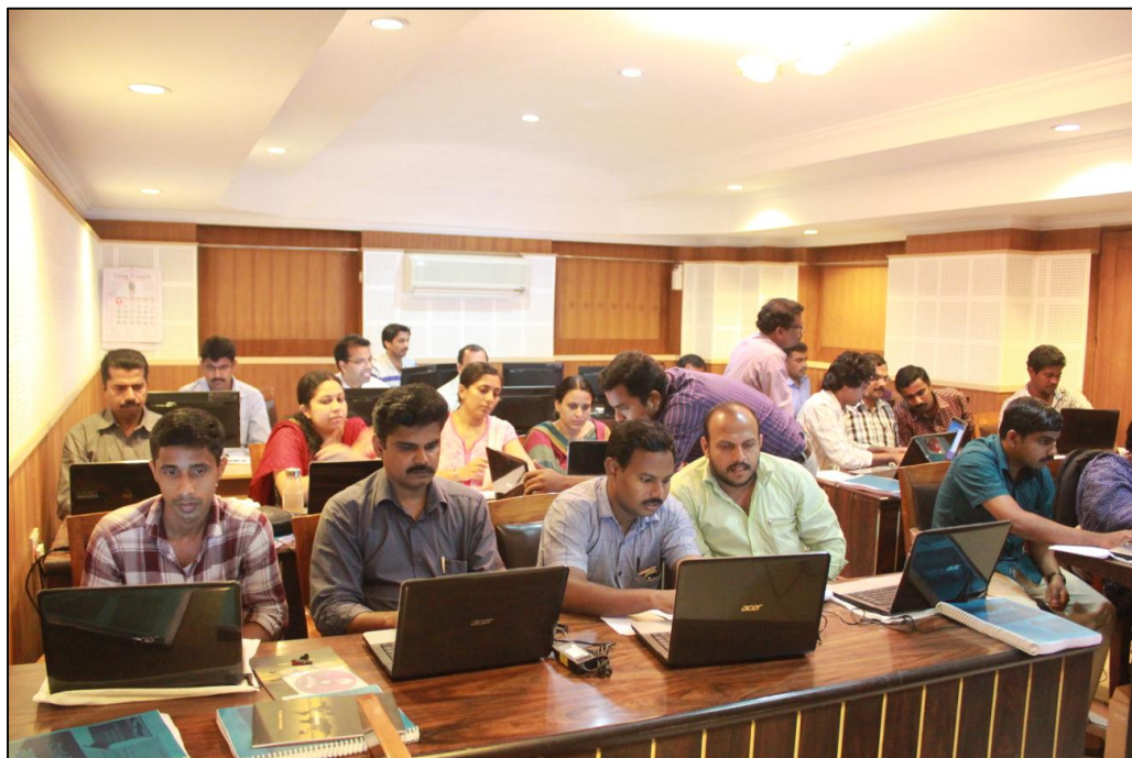
Hands-on Training Session (30/05/2014)