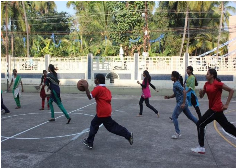
Inter department games