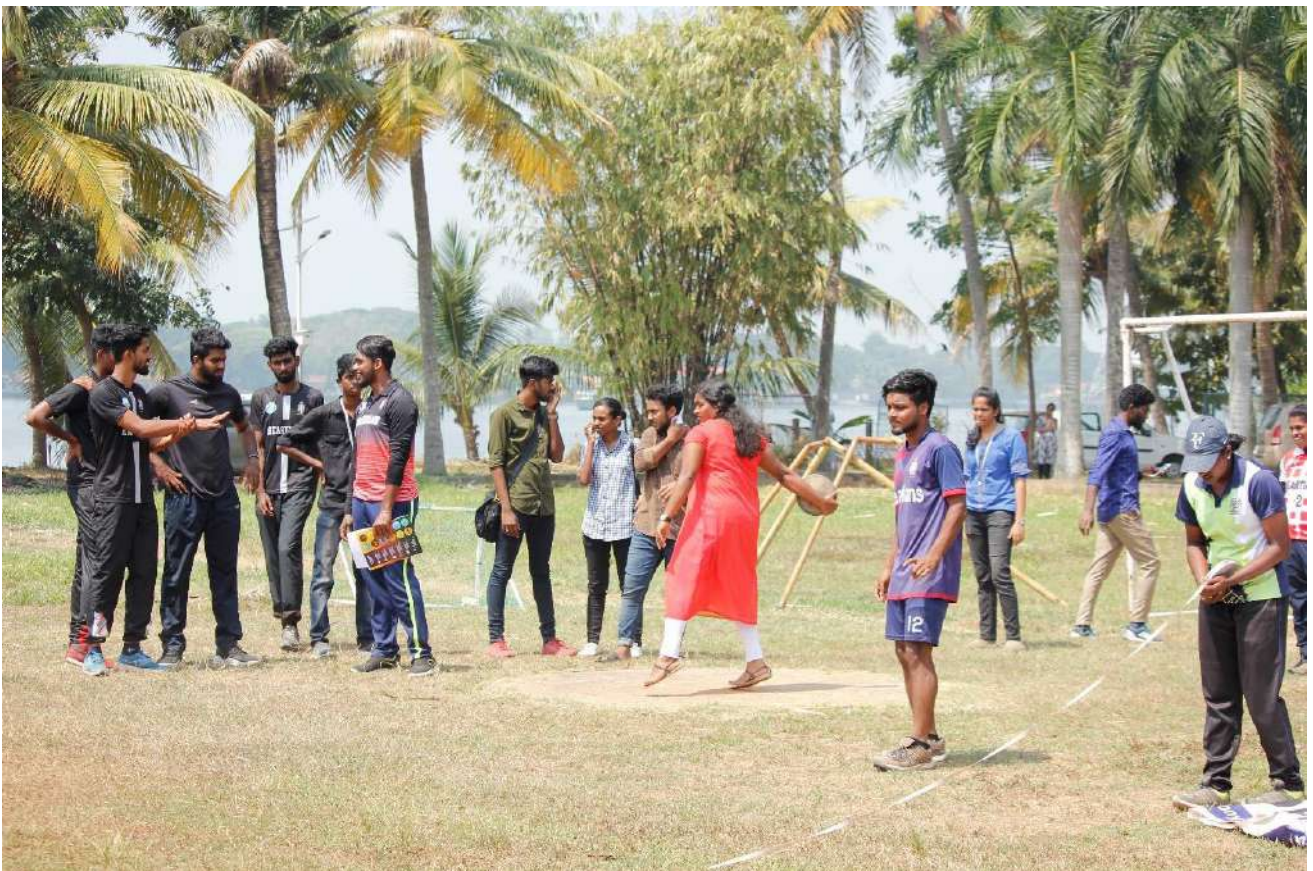
INTERCOLLEGIATE BLIND CRICKET TOURNAMENT (29/01/2019)