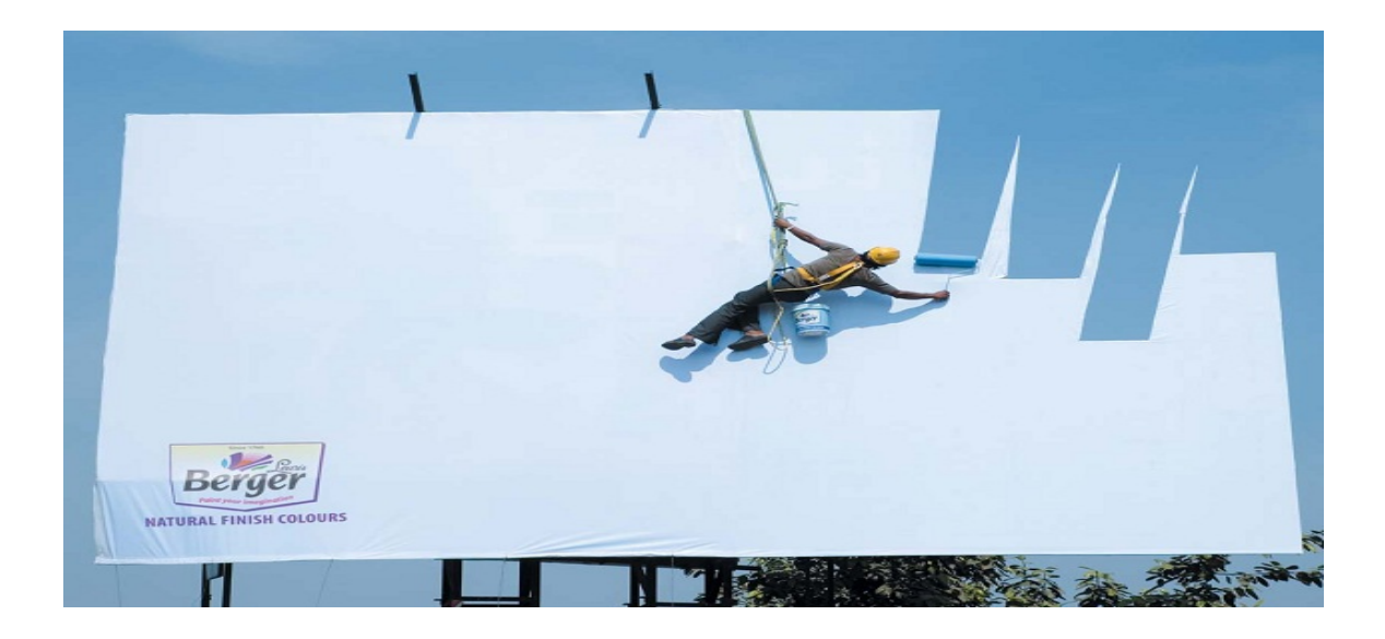
Figure 1.1.2: Advertisement of Berger Paints

Look at the following advertisement of Berger Paints, which was seen in 2009 and grabbed a lot of attention of its viewers.