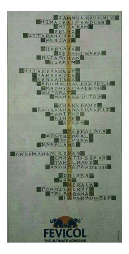
Figure 1.1.3: Advertisement of Fevicol

This advertisement of Fevicol was printed in the newspapers a day before the Independence Day. This advertisement presented the concept of Fevicol's product, amalgamated with the zeal of nation's unity. Such a blend made it worth remembering by its viewers.