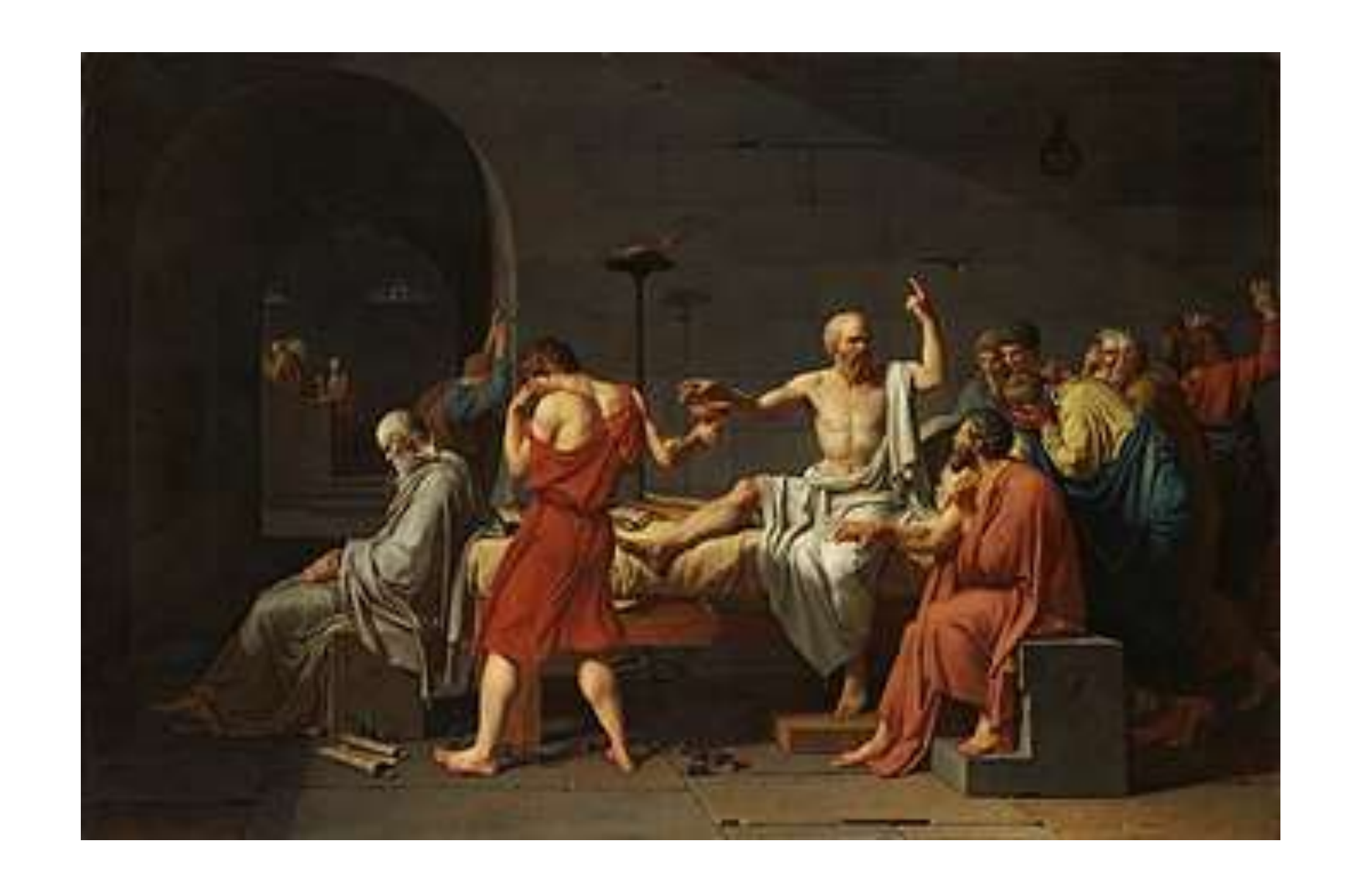
Death of Socrates- Jacques Louis David, 1787