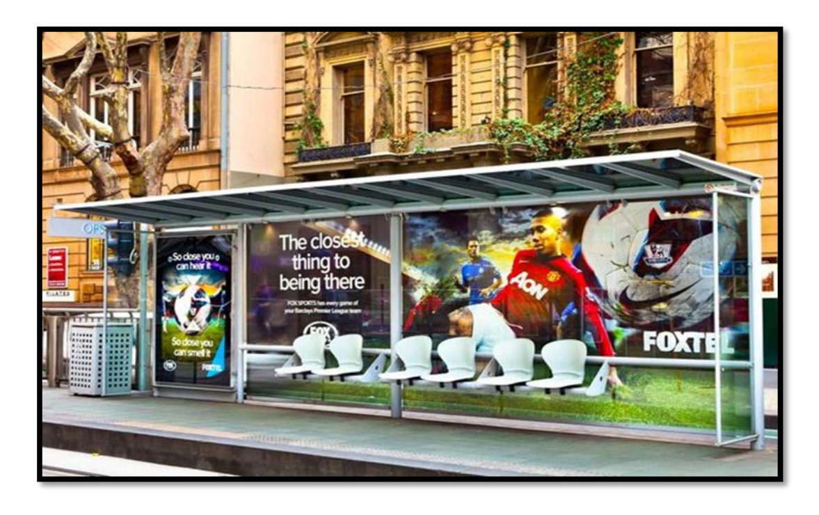
Figure 2.1.13: An Example of Outdoor Media Advertising