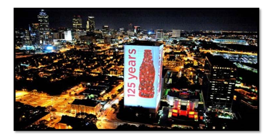
Figure 2.1.1: Coca-Cola's Campaign for completing 125 Years of Success

The above snippet highlights how Coca-Cola used an Integrated Marketing Communication Campaign to say "Thank You" to their consumers for the magnificent 125 years of success.