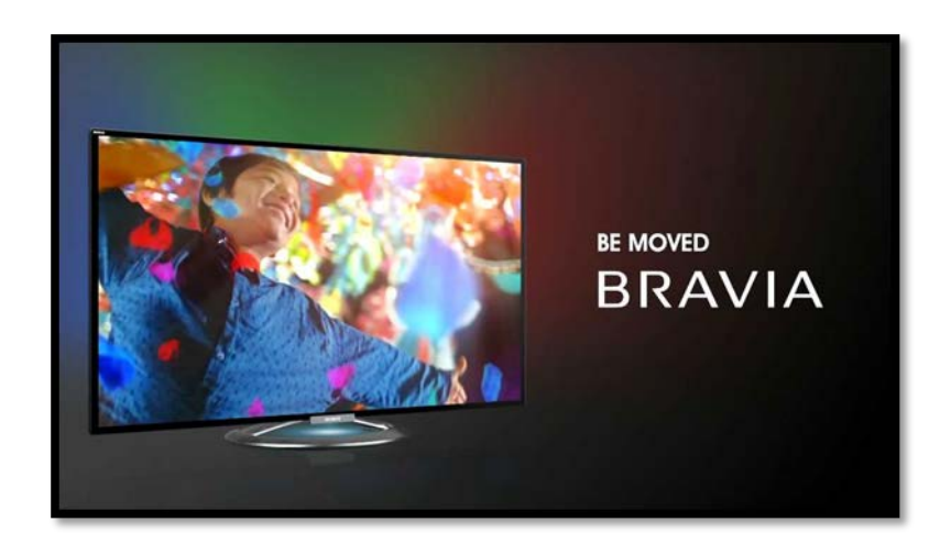
Figure 2.1.11: An Example of Broadcast Media Advertising