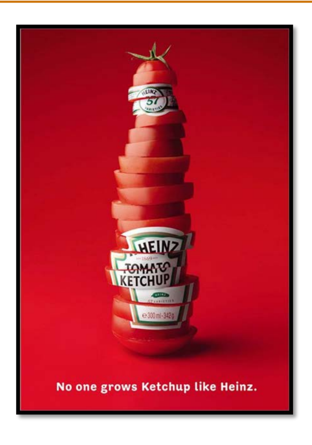
Figure 2.1.6: An Example of End Product Advertising