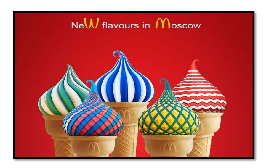
Figure 2.1.18: An Example of National Advertising

National advertisements are broadcasted on televisions, radios, newspapers, magazines, billboards and the Internet. National advertising is an expensive affair; therefore, it is carried out by large and well-funded companies such as Coke, Pepsi, Procter & Gamble, Johnson & Johnson etc. The companies intending for national advertisements identify a specific target audience and then build a brand image. Companies sometimes introduce new brands and emphasise on brand loyalty for the established ones through national advertising. The following advertisements highlights the new flavours of ice-cream introduced by Mc Donald's in Moscow.