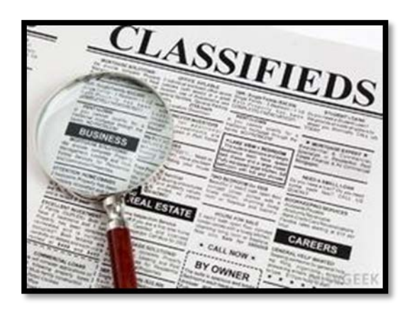
Figure 2.1.2: An Example of Classified Advertising

as they are charged based on per line. These are not widespread as large display ads. They do not include any graphics.