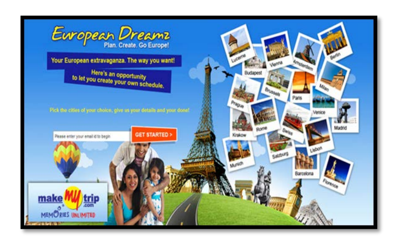
Figure 2.1.8: An Example of Periodical Advertising

a. Periodical Advertising: Periodical advertising refers to advertisements which are published in magazines, newspapers or any publication that comes out at regular intervals.