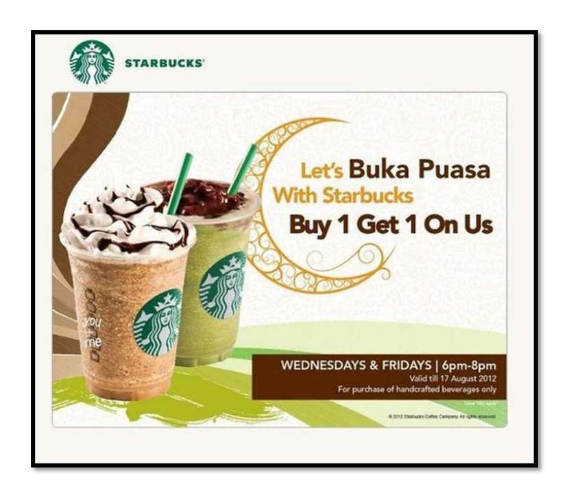
Figure 2.1.7: An Example of Direct Response Advertising