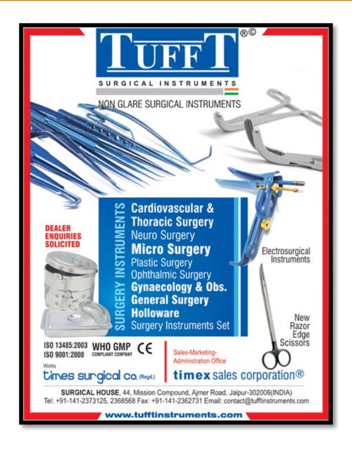
Figure 2.1.16: An Example of Professional Advertising