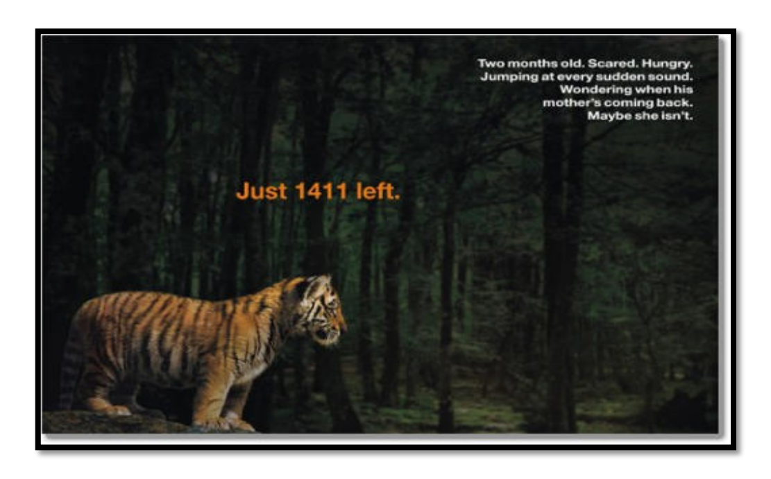
Figure 2.1.17: An Example of Corporate Advertising