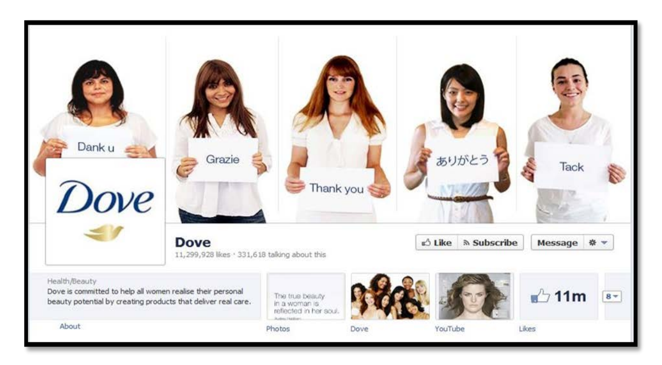
Figure 2.1.20: An Example of Global Advertising

The example from Dove campaigns depict that despite cultural differences, the ladies all over the world thank Dove for taking care of their hair and skin health.