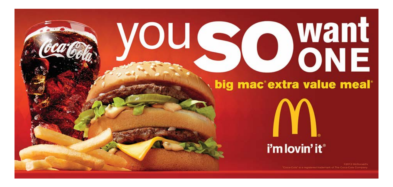
Figure 2.1.5: An Example of Co-operative Advertising

operative advertising, sharing the cost of advertisement for their mutual benefit is a common practice.