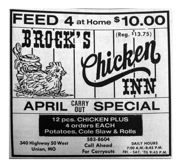
Figure 2.1.19: An Example of Local Advertising

Local advertising is actually about knowing and interacting with neighbours and people in the vicinity. It is more about developing relationships than investing money. This requires small businesses to actually move out from their offices and interact with prospective consumers.