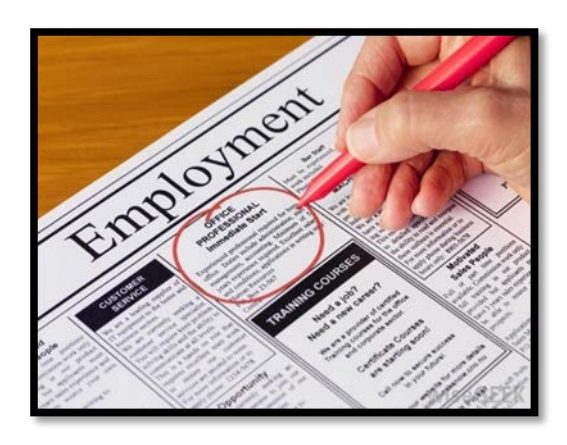
Figure 2.1.3: Another Example of Classified Advertising