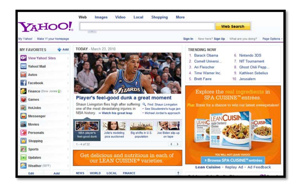
Figure 2.1.14: An Example of Digital Media Advertising

Any advertisement which appears via the Internet or online is known as digital media advertising. Digital advertising has evolved rapidly in the last 15 years and market leaders have realised the importance and the complexity it poses.