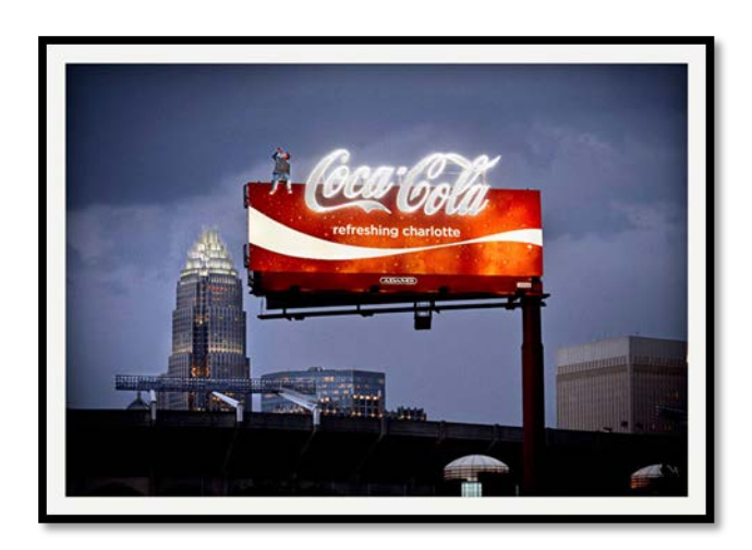
Figure 2.1.12: An Example of Outdoor Media Advertising

Outdoor media advertising refers to billboards, bus shelter posters, fly posters, digital posters etc. This type of advertising is also known as out-of-home advertising as these ads reach out to consumers when they are outside home.