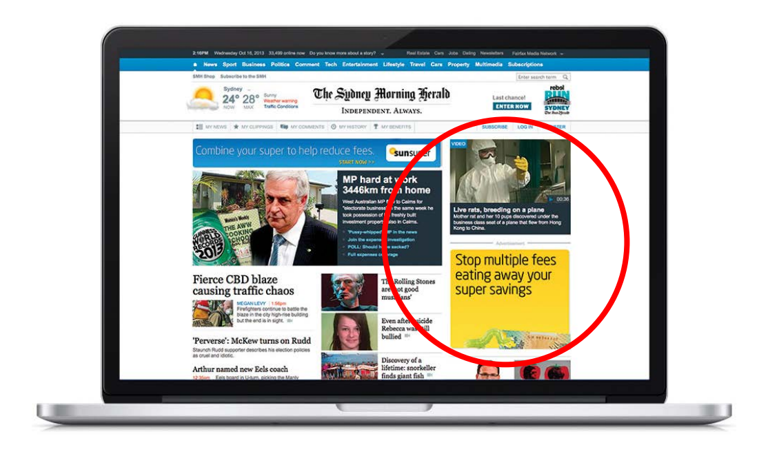
Figure 2.1.4: An Example of Display Advertising