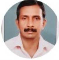
Thomas T P

Dashboard > Users > Thomas T P > View profile