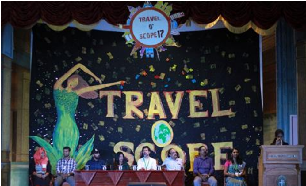
TRAVEL 'O' SCOPE

An intercollegiate fest under the initiative of Tourism Club and B.com Travel and Tourism was held on 20 January 2017. Various competitions were organized as part of the event. Students from various colleges across the state participated in the event.