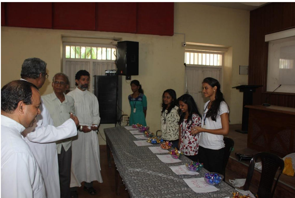
KINASH Exhibition of handmade products and indigenous food items