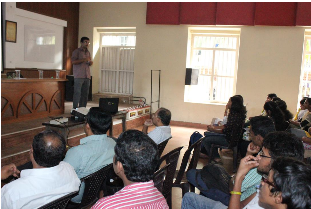
Physics Association Inauguration