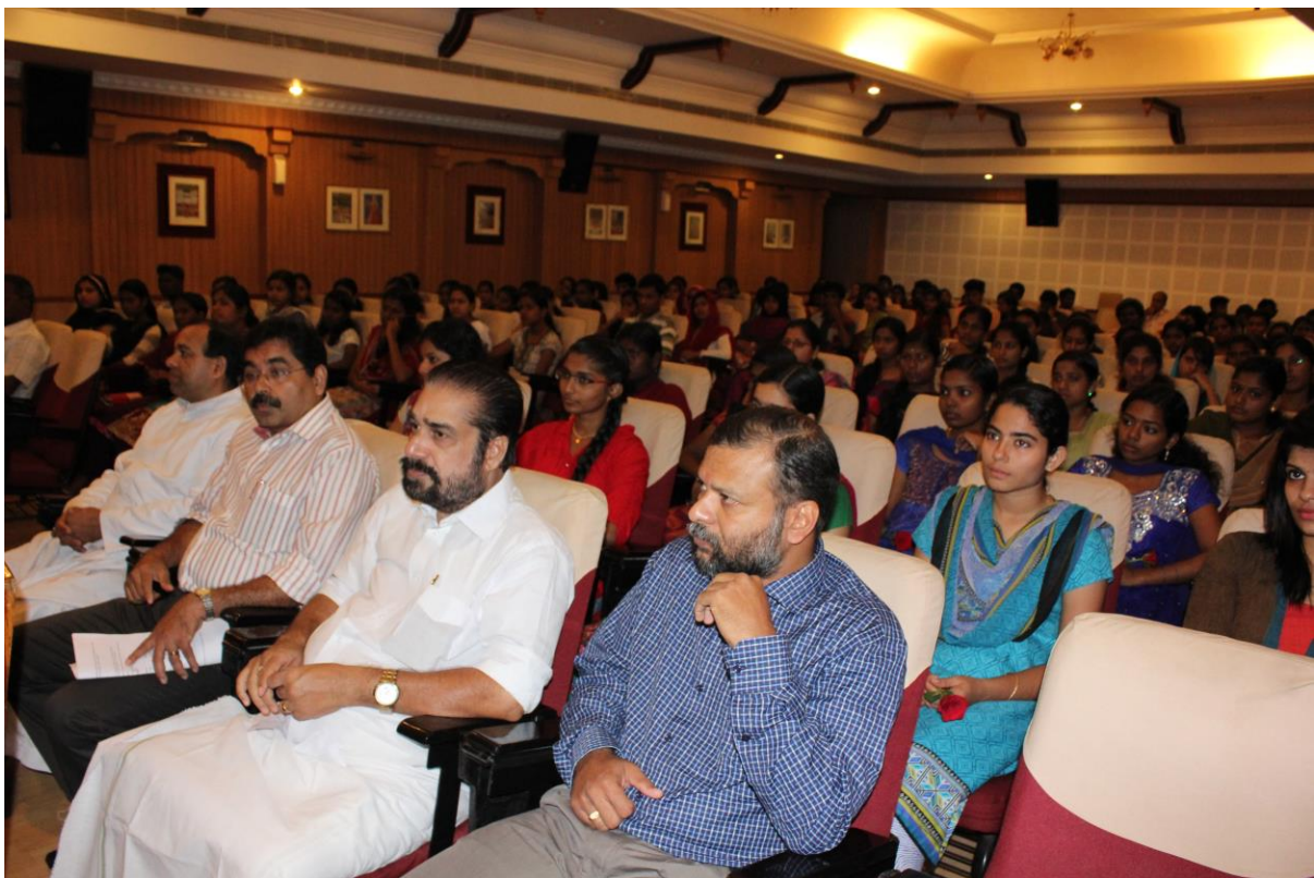
ORGANIZED BY: Department of Botany, Sacred Heart College, Thevara