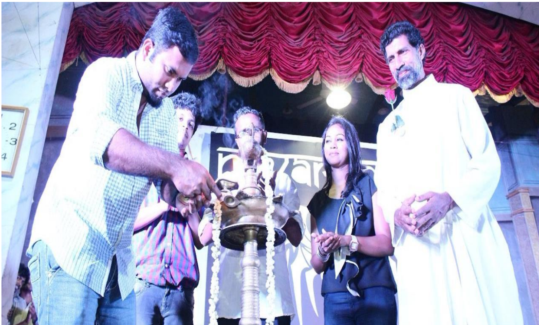
Tandav-Commerce Fest (20/02/2015)

TANDAV, the mega inter-collegiate fest by the Department of Commerce was held on 20 th February 2015. Various competitions were organized and cash prizes were awarded to the winners. The event was inaugurated by cine artist Mr. Aju Varghese.