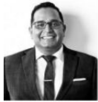
Vijay Shekhar Sharma