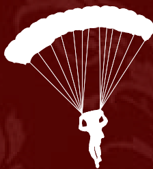
The Survival Summit