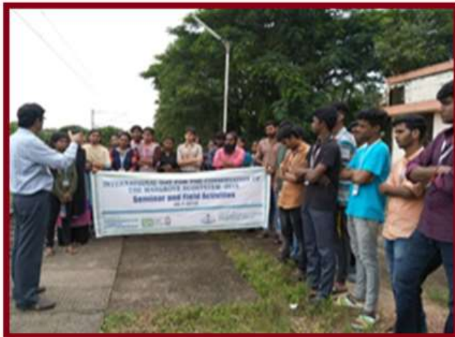
Mangrove Day Celebration