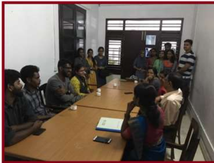
Alumni Meet 2019