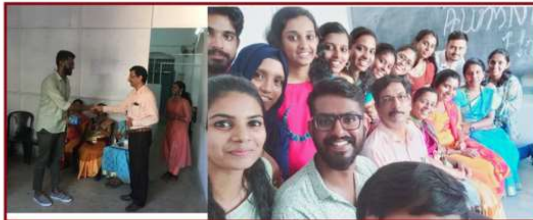
Alumni meet 2020 (19/01/20)