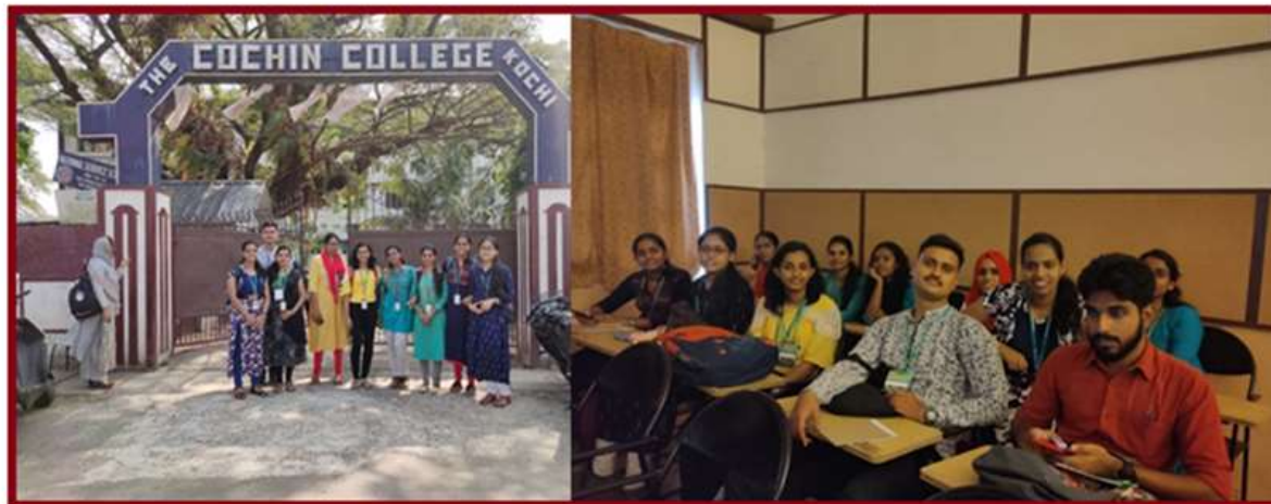
Workshop on environment and sustainable development (9/01/20)