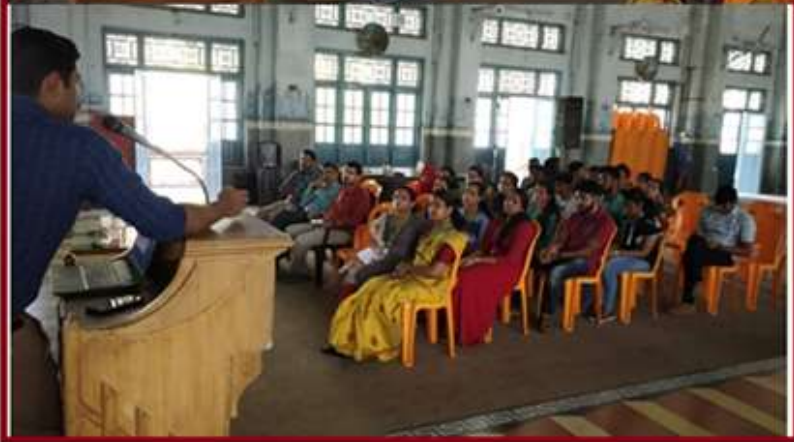
Seminar on Corona Virus (25/02/20)