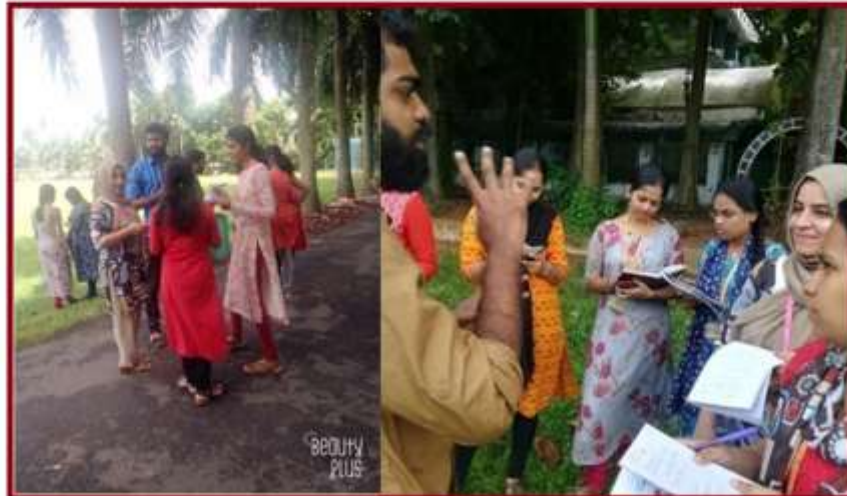
Workshop on Geographical Information System