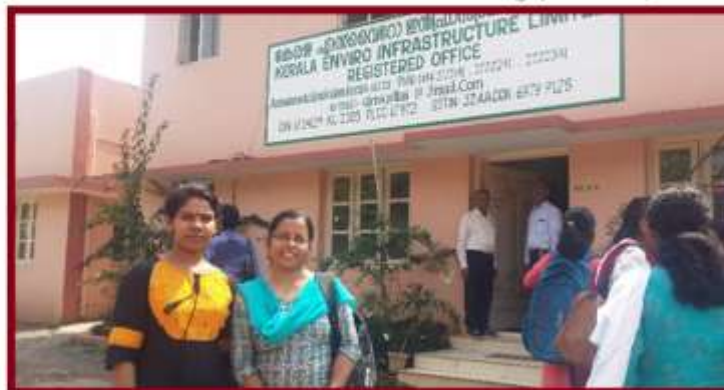
Short Term Training Programme on "Recent Advances In Environmental Engineering And Management (RAEEM)", 2nd to 7th march 2020