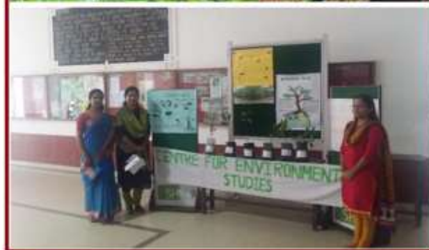
Mangrove day Celebration (26/07/2019)