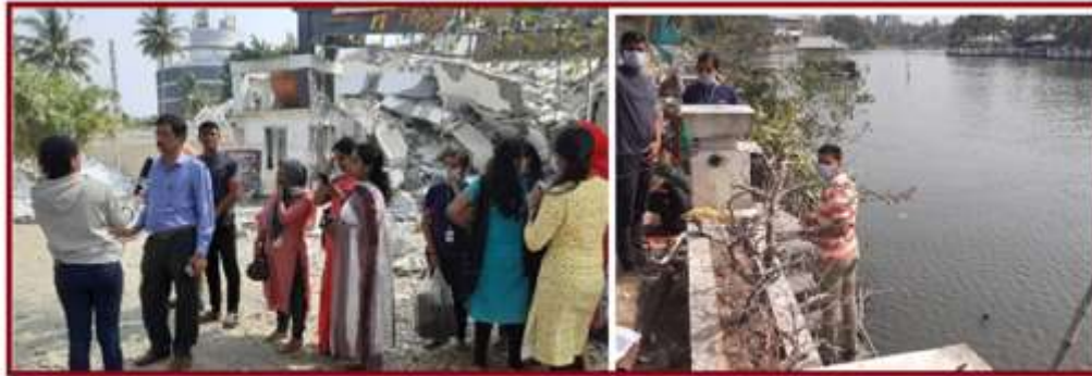
Environmental impact Study at Flat Demolition site, Maradu, Kochi. (14/01/20)