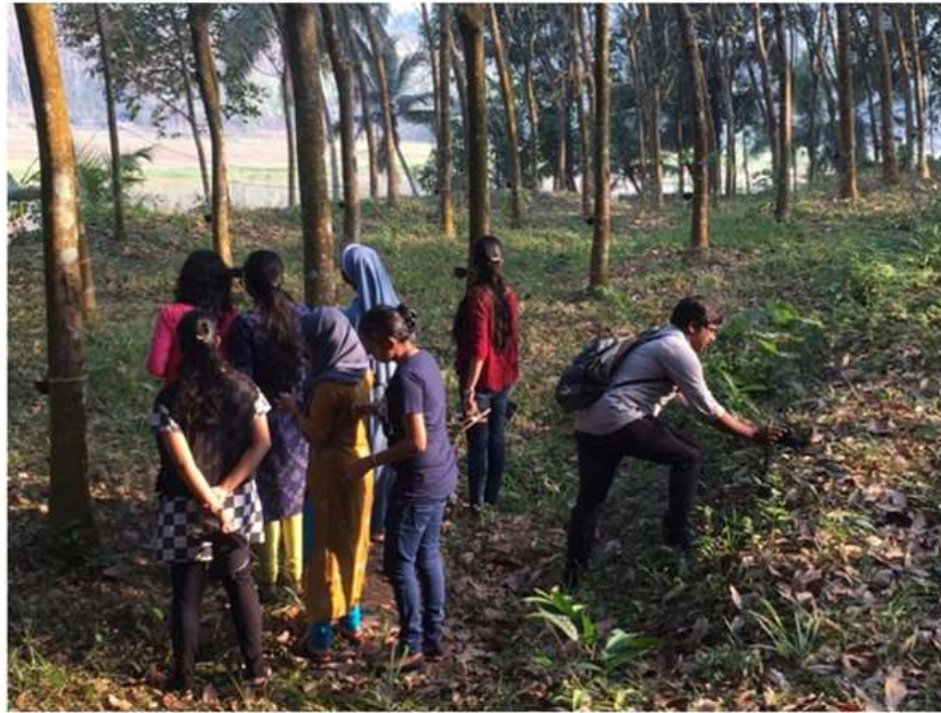
Extension centre bird count & bird survey (04/01/2020)