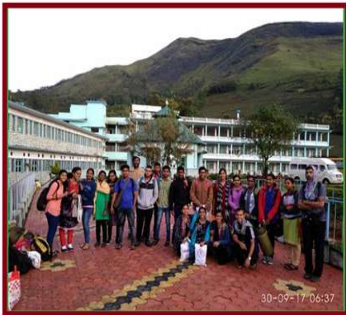
Kanathallore Visit-30/09/2017 to 2/10/2017