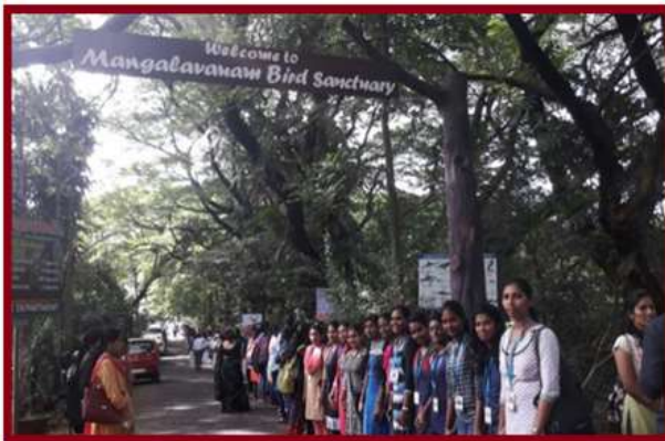
Protest at Mangalavanam