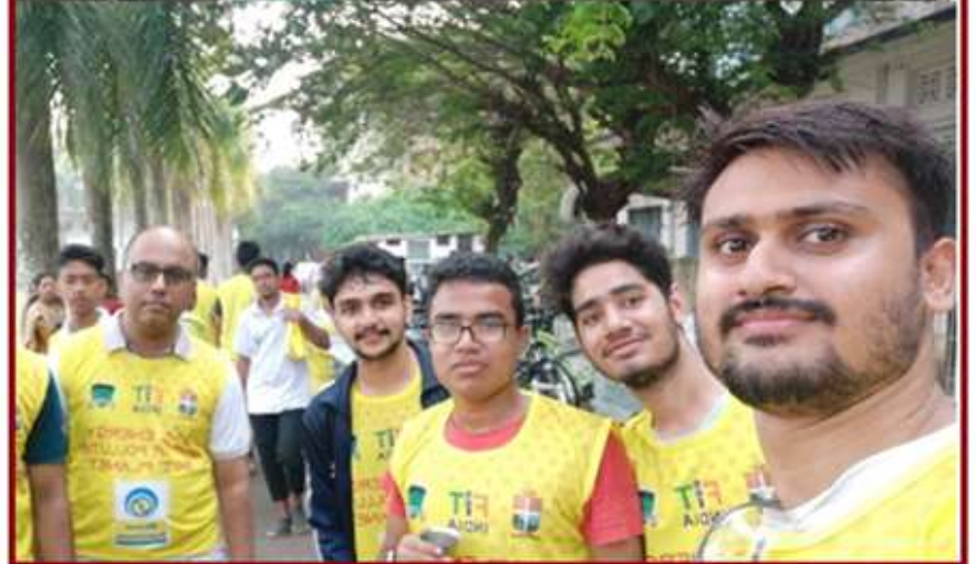
Paristhidikam 2019-20 ( 15/02/20)