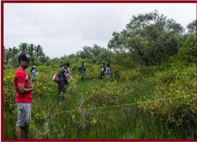
Mangrove Field Study– 2018 (Kannur Kandal Project)