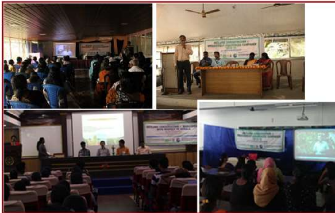
Wetland awareness classes and screening of documentary on wetlands- 1.10.19 to 30.11.19