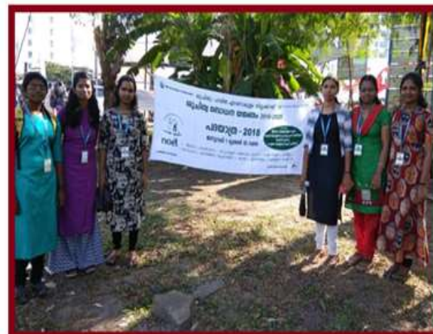
Patha Yatra (11/01/2018)