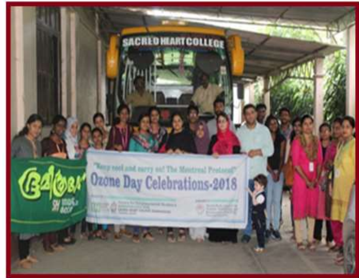
Ozone Day Celebration, 2018