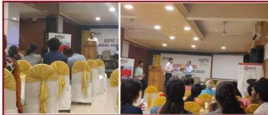
ASPIC Club Annual meeting (20/02/20)