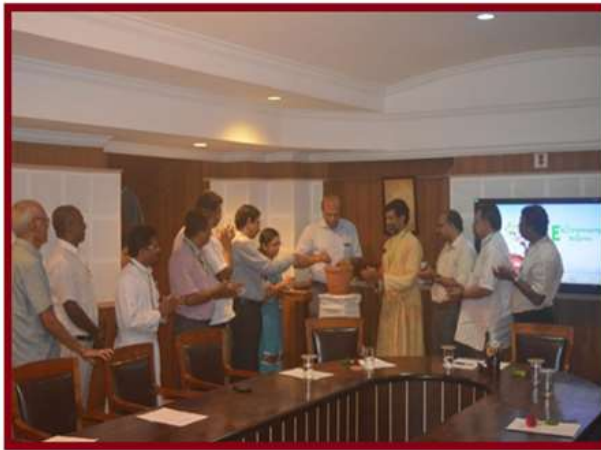
Inauguration of Msc Environmental Science (07/9/2016)