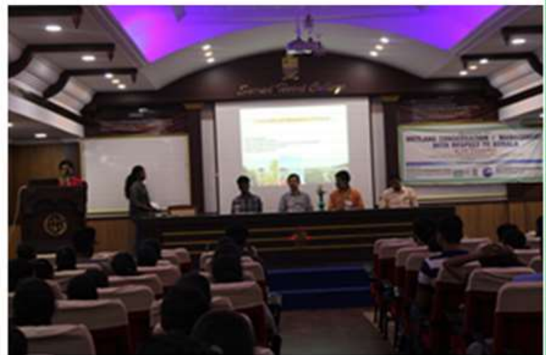
Conducted a talk on "Wetland conservation and management with respect to Kerala", 22/11/19