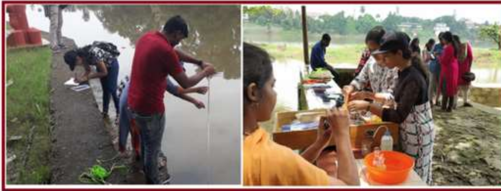
Freshwater Ecosystem - field study (29-8.19 to 30.8.19)