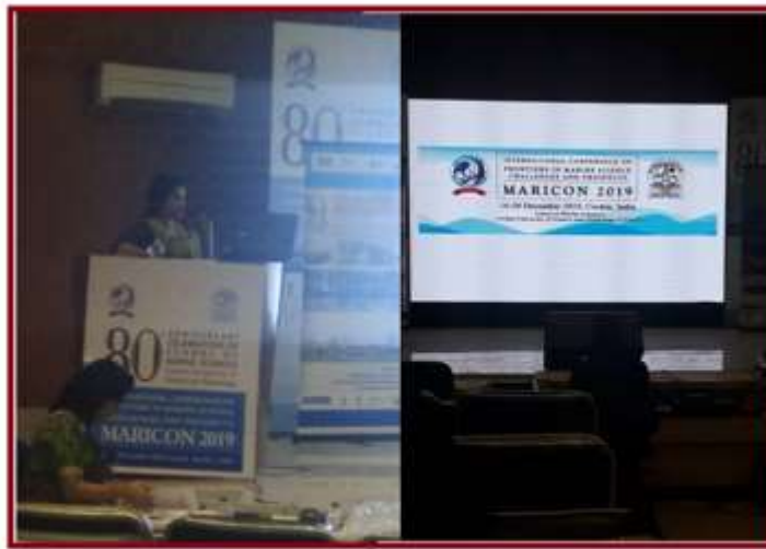
Paper presentation, Maricon ( 19/12/2019)