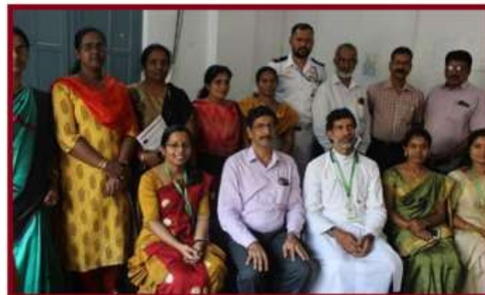
PTA Meeting (29/01/20)