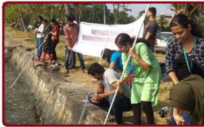
Wetlands day celebration (02/02/2020)