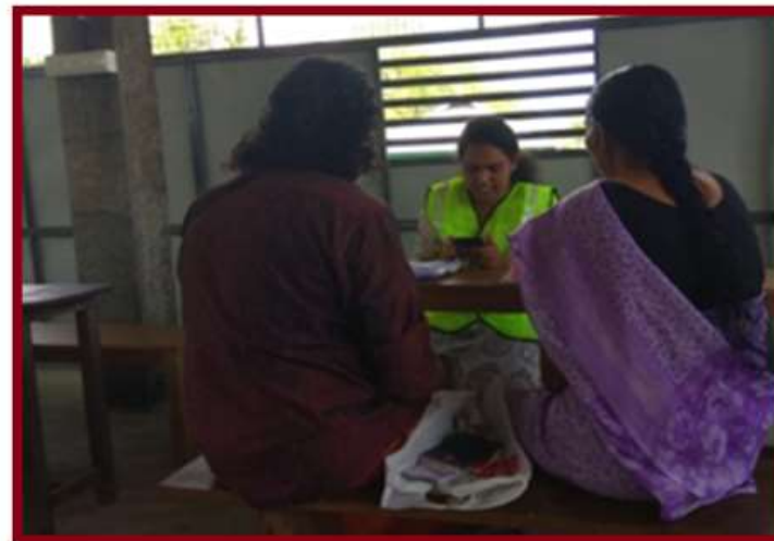
Volunteers for Mercy Corps (IGO) Flood Relief on 7 th , 12 th , 13 th and 18 th September 2018