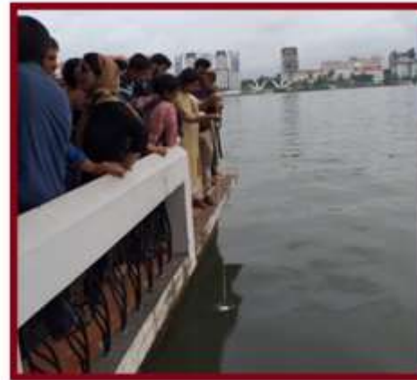
Participation in CMFRI project to study Kerala's Vembanad Lake (05/08/2019)