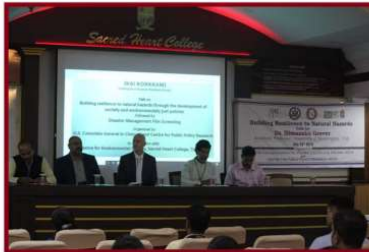
Talk and Disaster management film screening: Break out event