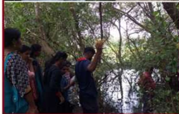
Mangrove field study at Nettoor (26/08/2019)