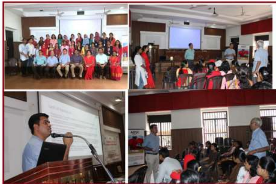
Inauguration of ASPIC Club and Seminar on Antibiotic Resistance