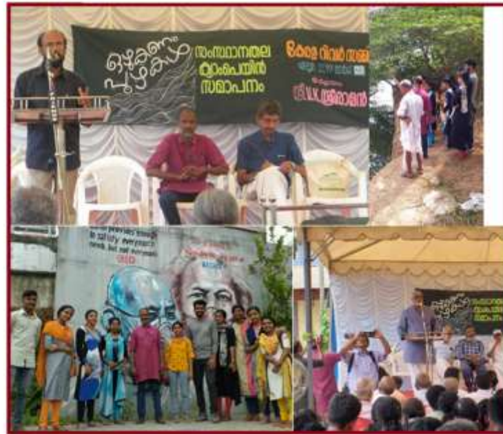
Students participated in the campaign 'Puzhaka/Ozhukanam (Rivers should flow) organised by 'Friends of Latha,' at Eloor on March 23, 2019, highlighted the importance of maintaining water flow in rivers.