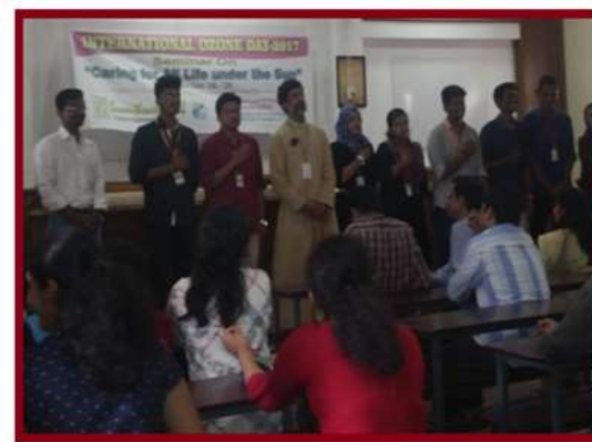
International Ozone Day (25/9/2017)