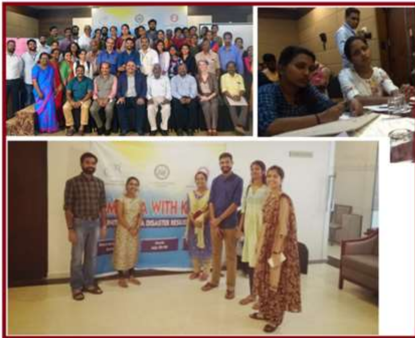
Work shop on Disaster management and Mitigation, Trivandrum