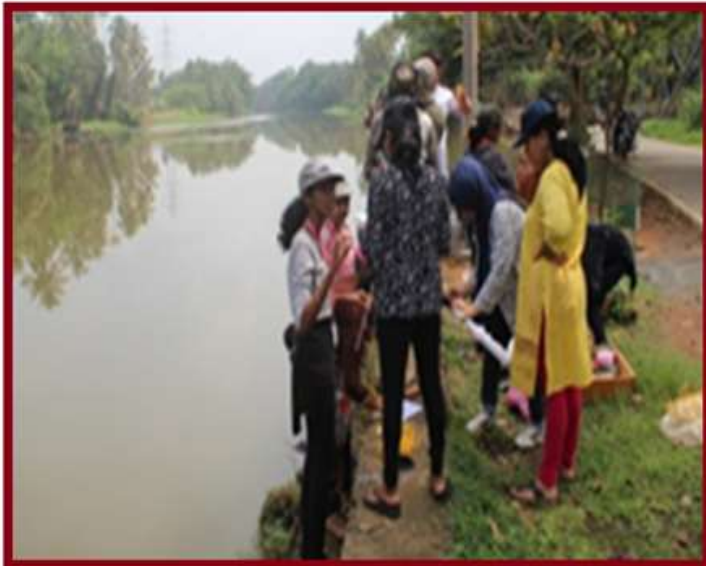
Fresh Water Ecosystem Study, 2018