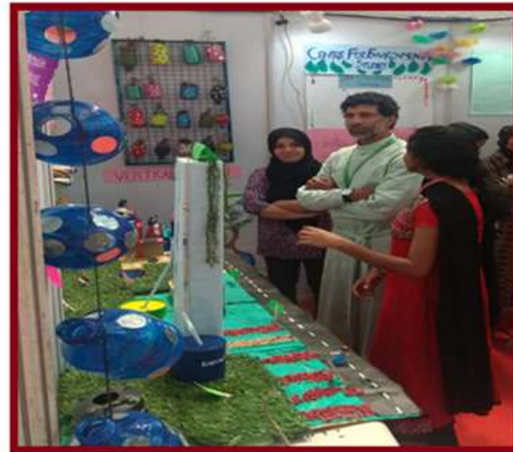
Educational Expo, from 17 th to 21 st December 2018