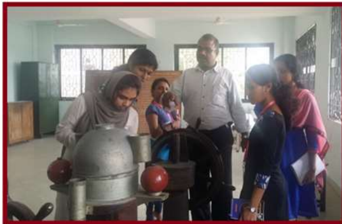
Short Term Training Programme On 'Fishery Technology', At CIFNET , Kochi. ( From 25/2/2019 To 28/2/2019)