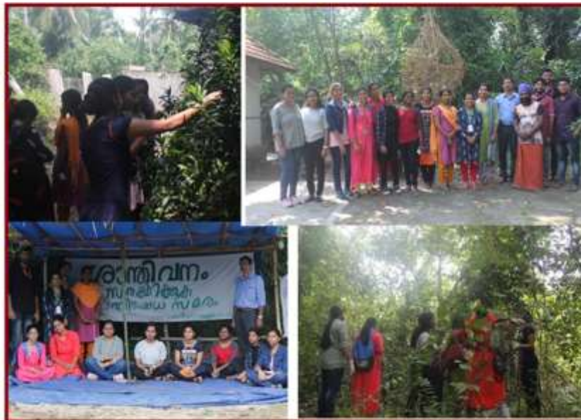
Shantivanam Visit on World Environment Day, June 5 th , 2019