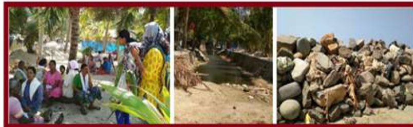
Chellanam Visit (03/01/2018)