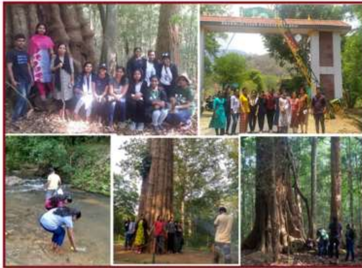
Forest Ecosystem Study, 2019 At Parambikulam Tiger Reserve