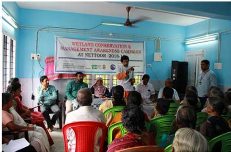
Wetland awareness programme, Nettoor (video presentation), 3.09.2019