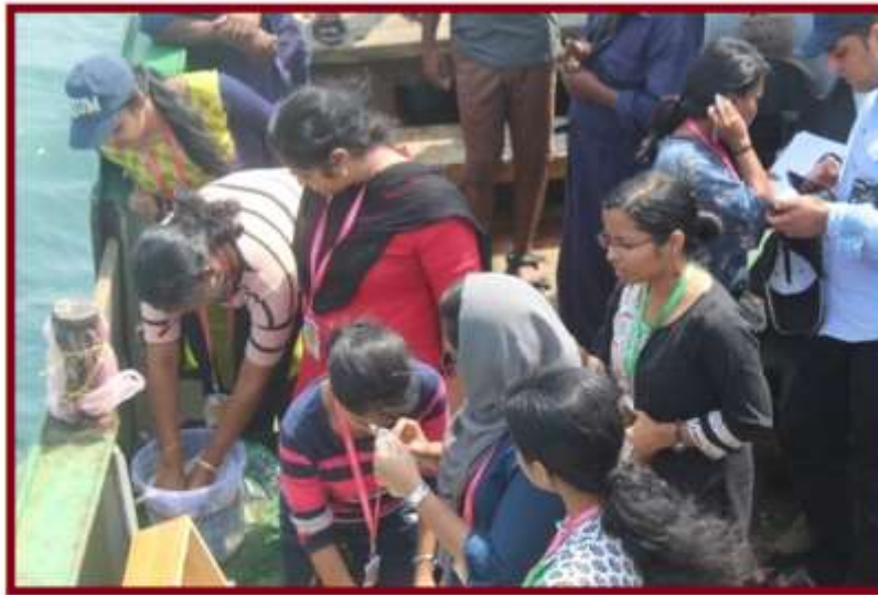
Marine Field Study, 2019