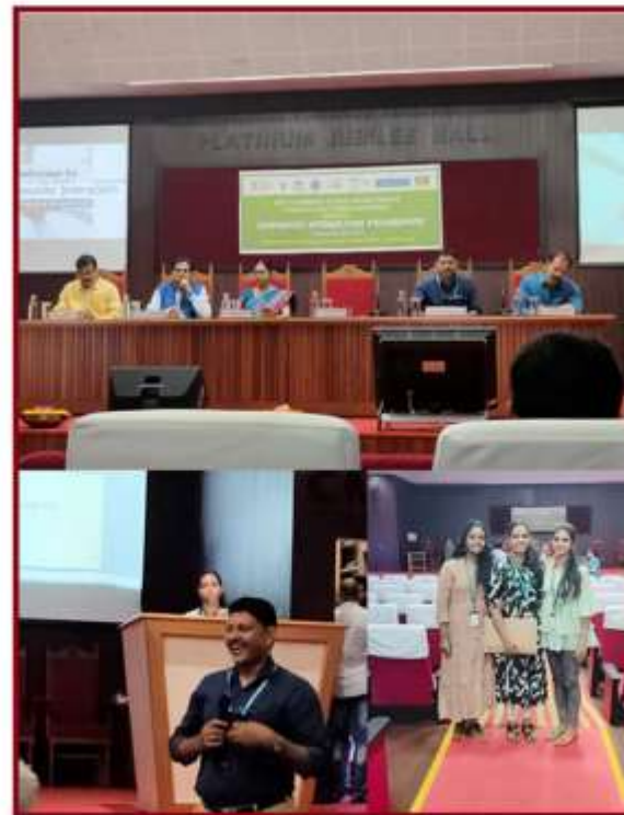
Presentation in Community Interaction Programme (20/12/19)