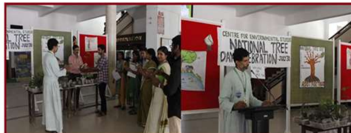
National Tree Day (01/08/2017)