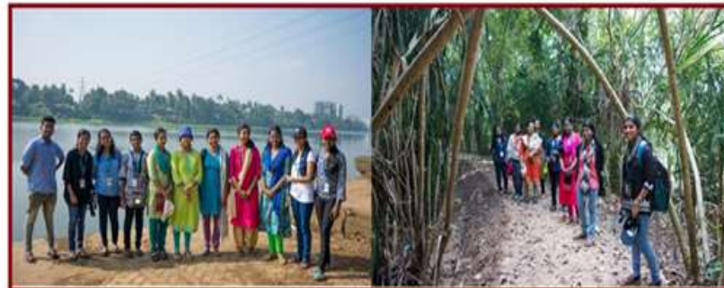
Periyar Ecosystem Field Study (23/10/2017 to 25/10/2017)