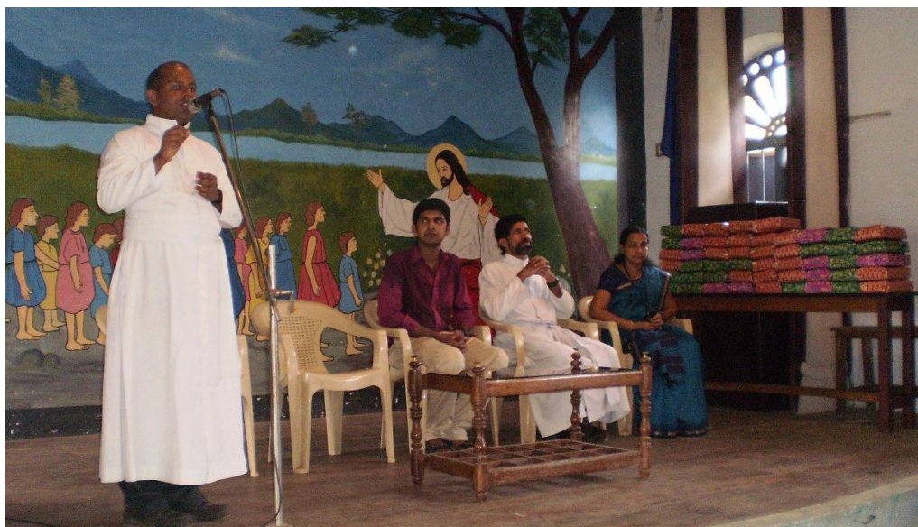
Distribution of Study Materials