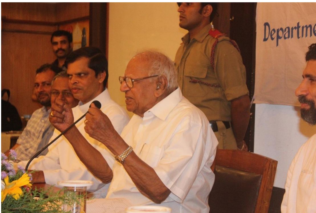
Justice V.R. Krishna Iyer -Seminar on Human Rights Issues of the Migrant Labourers in Kerala