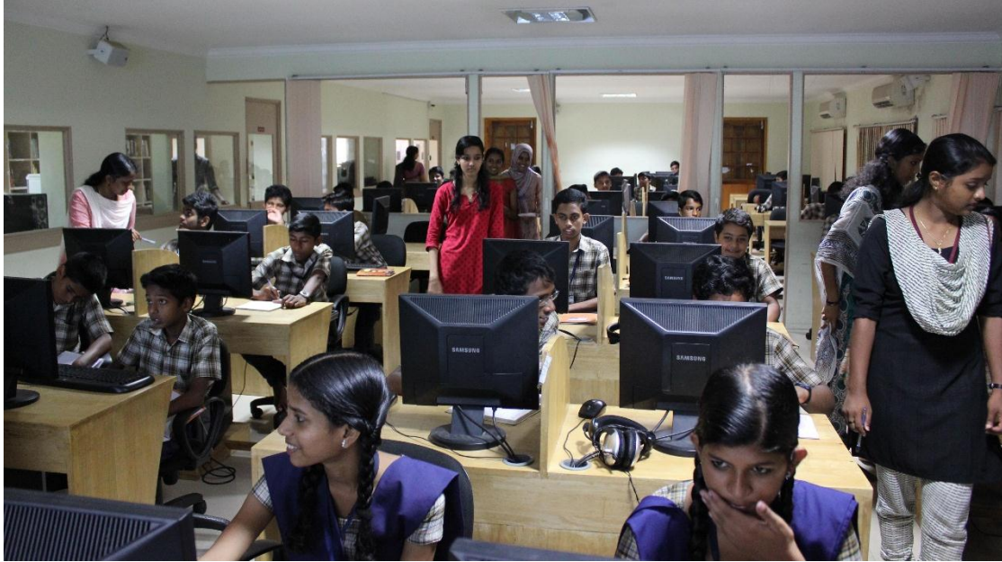
Computer Literacy Programme