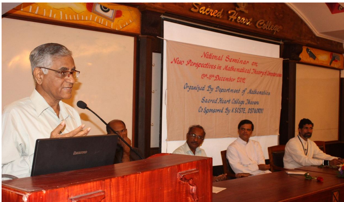
New perspectives in Mathematical theory of Computer Science

The department organized a National Seminar on “New perspectives in Mathematical theory of Computer Science” in association with Kerala Mathematical Association from 13 th to 15 th December 2012. The programme was sponsored by DST, DRDO & KSCSTE.