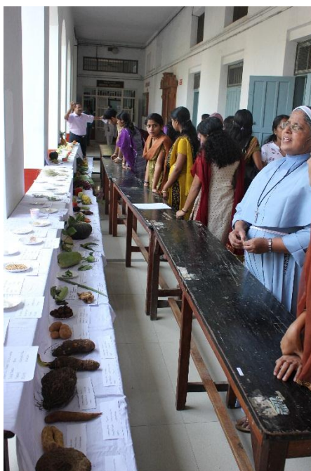
Seminar on 'Food security: Today and tomorrow

The formal valedictory function of the Botany Association's current academic year activities is planned to be conducted on 4 th April 2013.