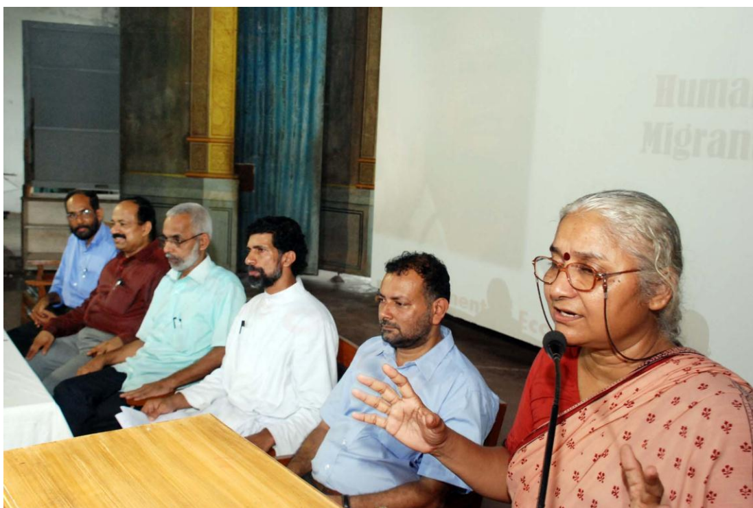
Medha Patkar - Seminar on Human Rights Issues of the Migrant Labourers in Kerala