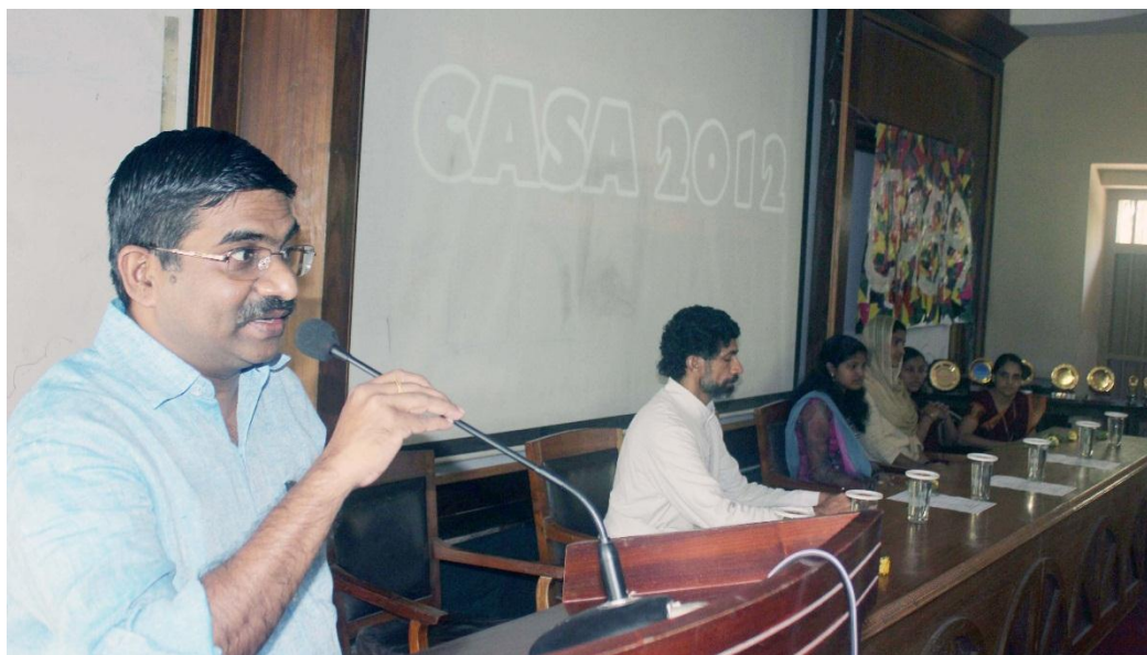
Inauguration of CASA 2012