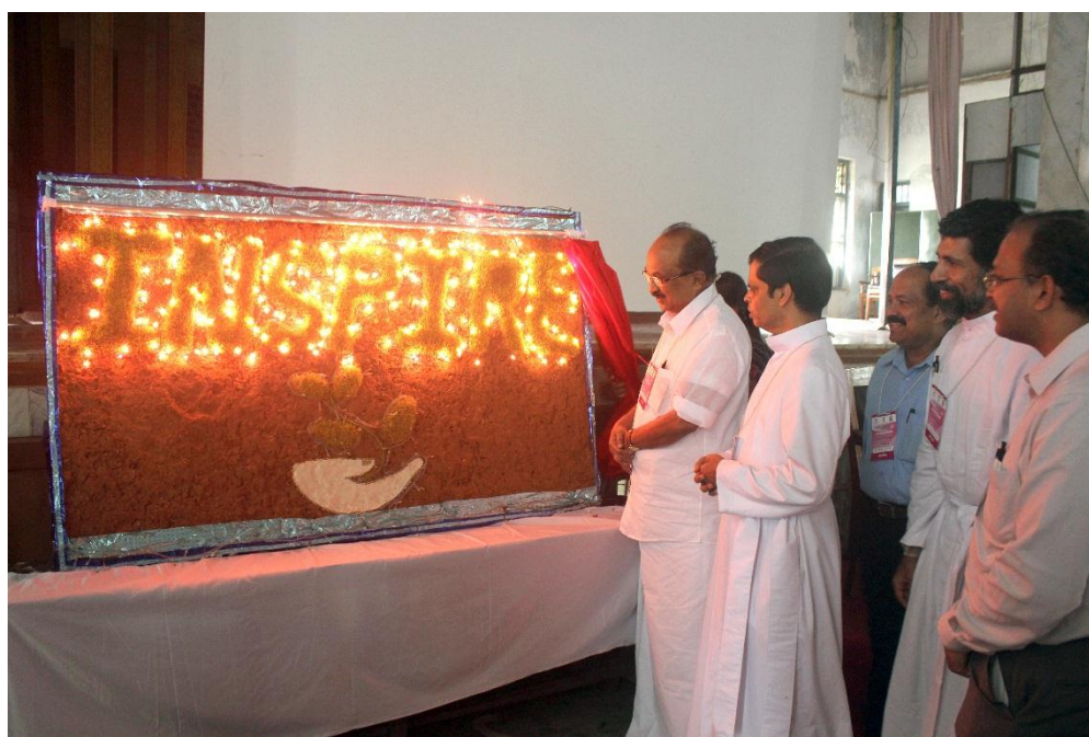
INSPIRE 2012 - Inauguration