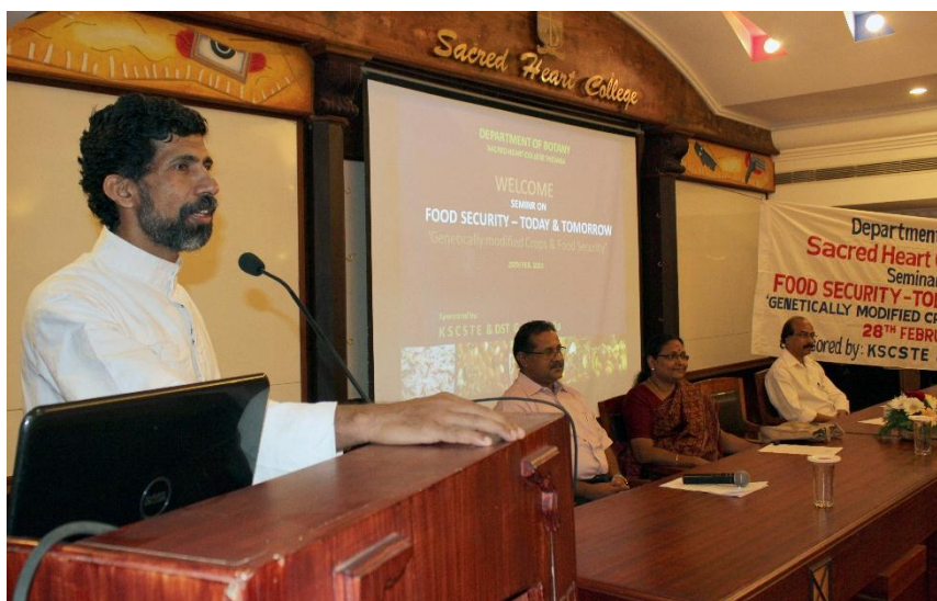
Seminar on 'Food security: Today and tomorrow