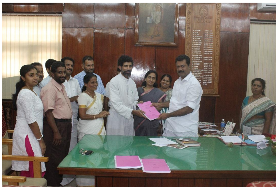
Handing over the Socio-Economic Survey Report to Kochi Corporation Mayor