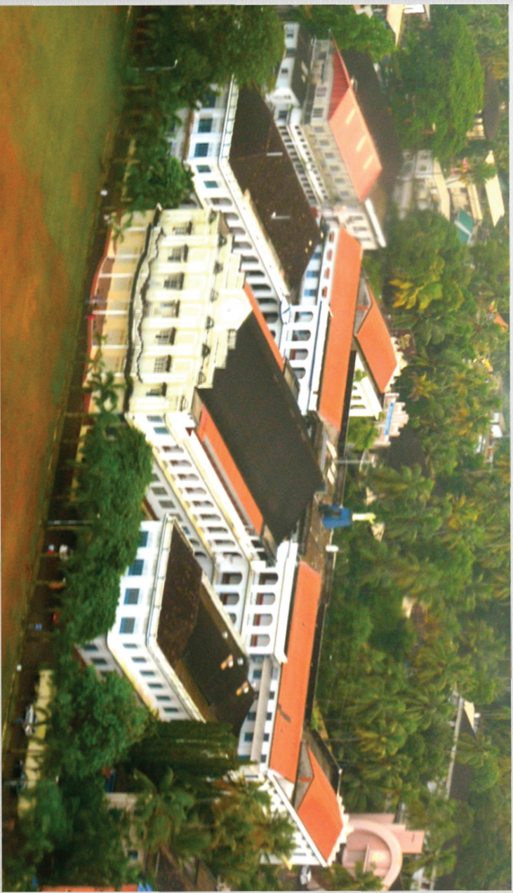
AERIAL VIEW OF SACRED HEART COLLEGE (AUTONOMOUS), THEVARA, KOCHI